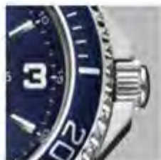
Crown protection & 100m water resistance