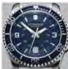
Unidirectional rotating bezel