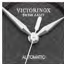
Swiss made automatic movement