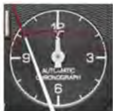
ETA Valjoux 7750 Swiss made automatic movement