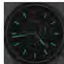
Super-LumiNova® for effortless readability in the dark