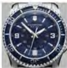
Unidirectional rotating bezel