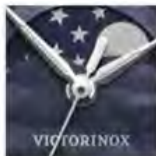
Counter-weight inspired by the Swiss Army Knife