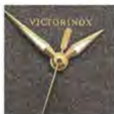
Counter-weight inspired by the Swiss Army Knife