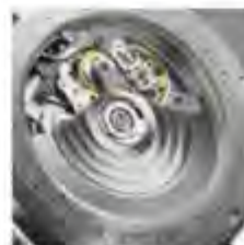
See-through case back