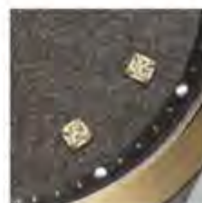
Swarovski crystals set on the dial*