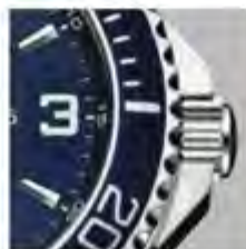
Crown protection & 100m water resistance