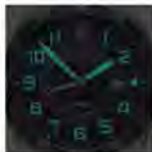
Super-LumiNova® for effortless readability in the dark