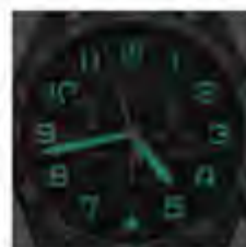
Super-LumiNova® for effortless readability in the dark