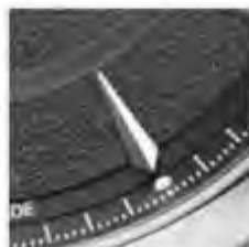
Polished pyramidal indexes