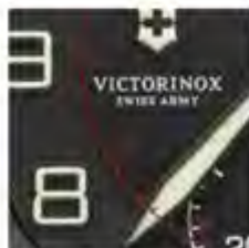
Military time printed under the crystal