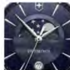
Genuine mother of pearl dial*