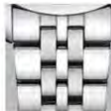
5-links polished and satin bracelet*