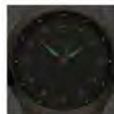
Super-LumiNova® for effortless readability in the dark