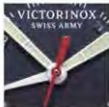
Counter-weight inspired by the Swiss Army Knife