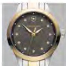
Case: \varnothing 28 MM