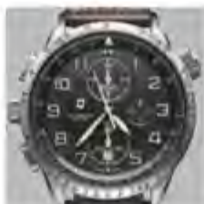
180° movement rotation