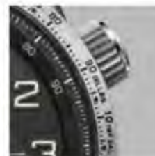
Circular slide rule