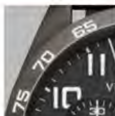
Matt Black PVD Treatment*