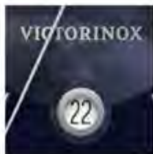
Circular date aperture at 6 o'clock.