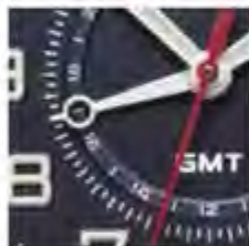
Dual-Time display (GMT function)*