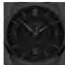
Super-LumiNova® for effortless readability in the dark