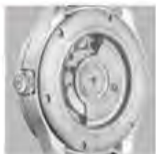
See-through case back